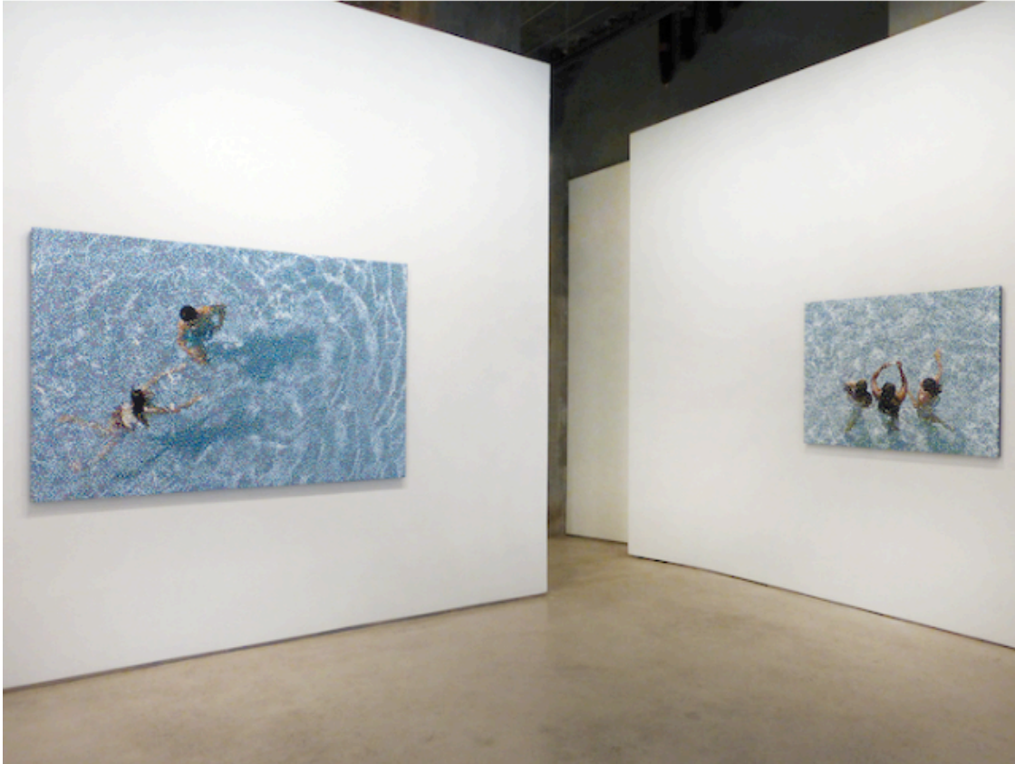
Works on display at Margaret Thatcher Projects. Paintings pictured: Untitled Swimming Pool XX, 2016 and Selfie Miami Beach, 2016.