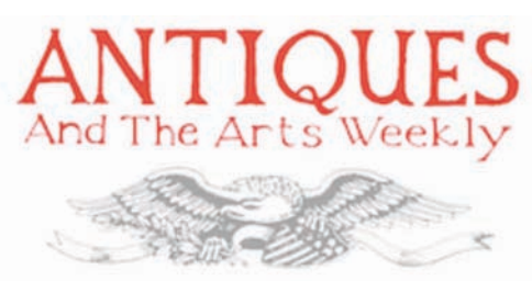
June 14, 2013