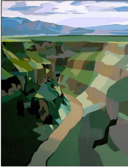
"Passage 5" (2005) acrylic on expanded PVC, by Maria Park

Bay Area painter Maria Park tries to fold that understanding back into static image-making.